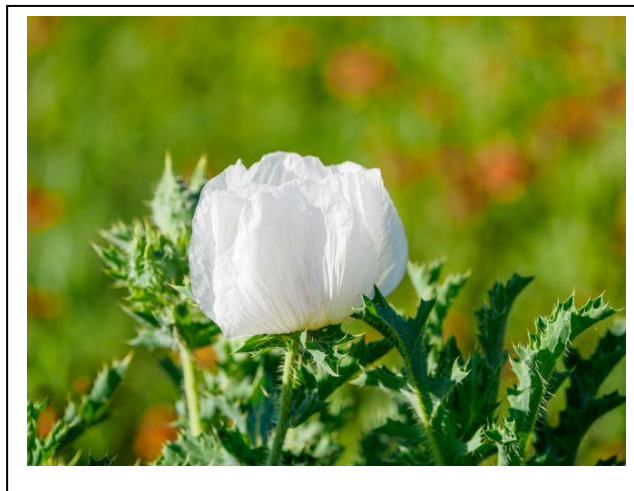
Prickly Poppy with Blurred Gallardia