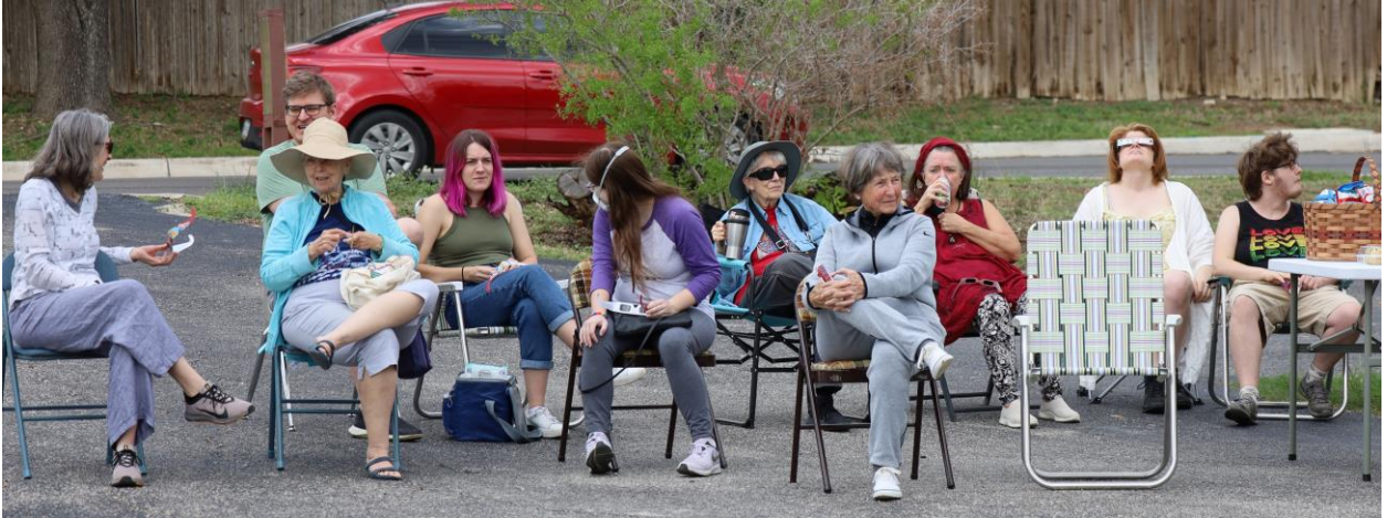
Parking lot eclipse party