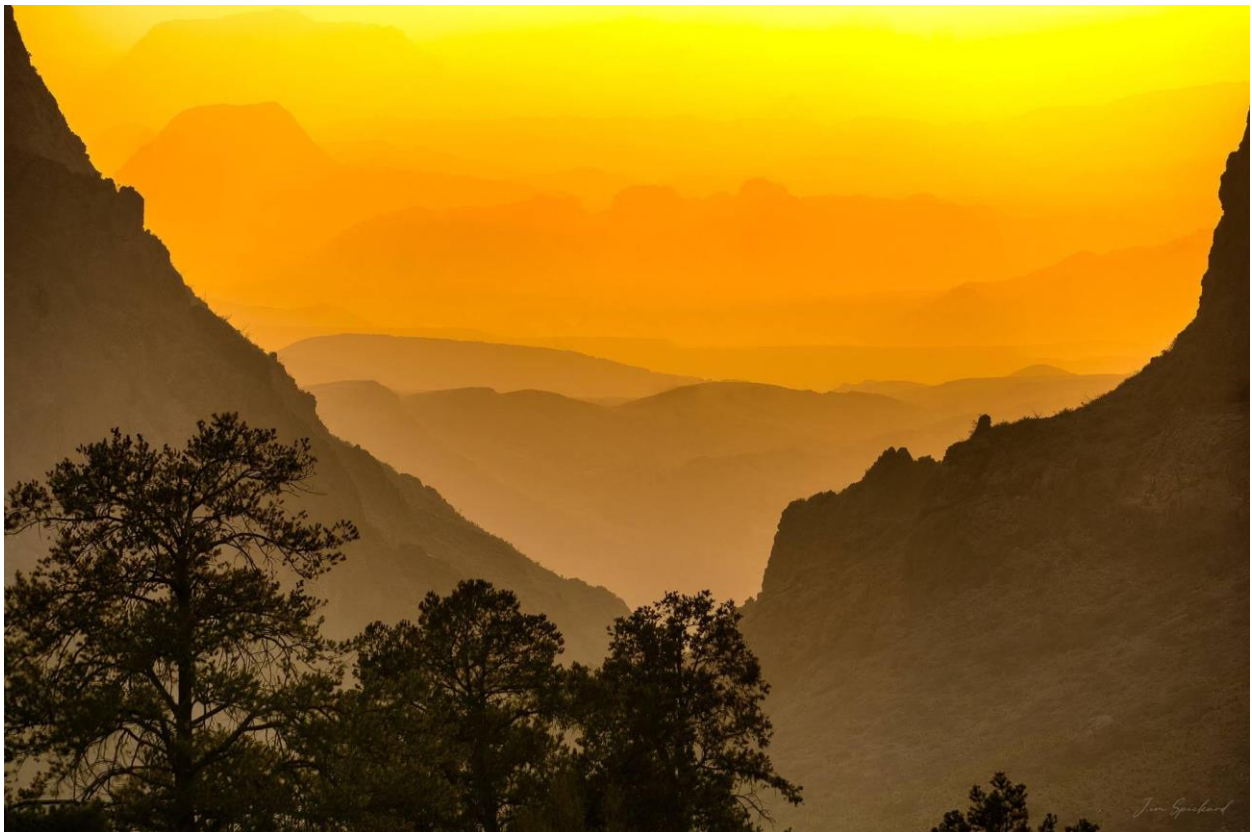
Big Bend Sunset

Please respond to peace@saquakers.org or in writing to the P&SC mailbox in the Library (or by USPS). It would be most helpful to have a response by Thursday, 15 August.