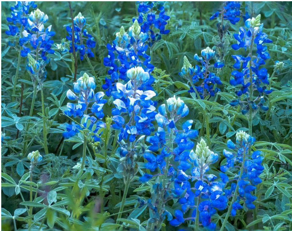
Bluebonnets after a rain